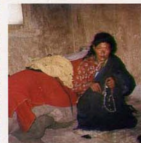
She needs your help.