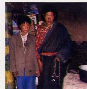
Mother and daughter.